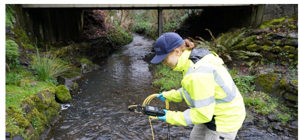
Staff member taking water quality samples in Oak Grove, OR

Through watershed protection and planning, OLWS is taking a long-term approach to protecting the health of our water resources. The OLWS stormwater management program provides monitoring and enforcement of water quality protections. Through watershed planning we are taking a big picture, long-term approach to protecting the health of neighborhood streams.